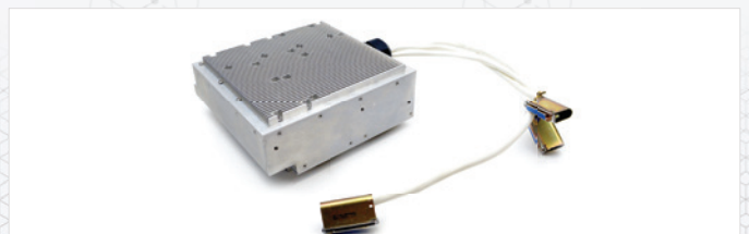
Environmentally Ruggedized 120VAC, 400Hz Power Supply

Each power supply system is designed to meet and/or exceed each individual customer's Size, Weight and Power (SWaP), Electromagnetic Interference (EMI), Electromagnetic Compatibility (EMC), thermal and structural requirements. We are extremely well versed in all military design specifications, ensuring fully compliant designs. We work diligently to provide solutions that will seamlessly integrate with your platform and also understand that protecting your assets and decreasing product down time is of critical importance.