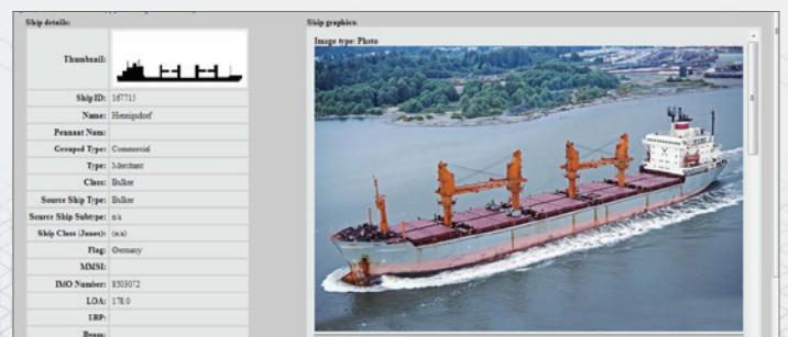
MCA ship database return